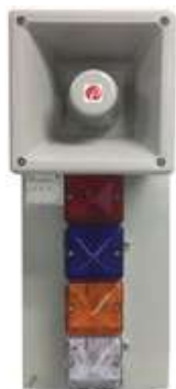
FA300 Alarm Bar